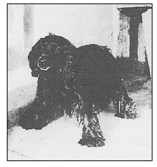
Black Peter

However the visionary and imaginative levels of experience do not abolish the level of reality for those who live in a physical universe still existing within the only partially realized salvation of the ultimate evolution of the System-of-Things to pity and mercy. The Captain/narrator is still brought to a Lemuel Gulliver-like state of bitter disillusion in a process that involves the stripping from him of all visible comforts.