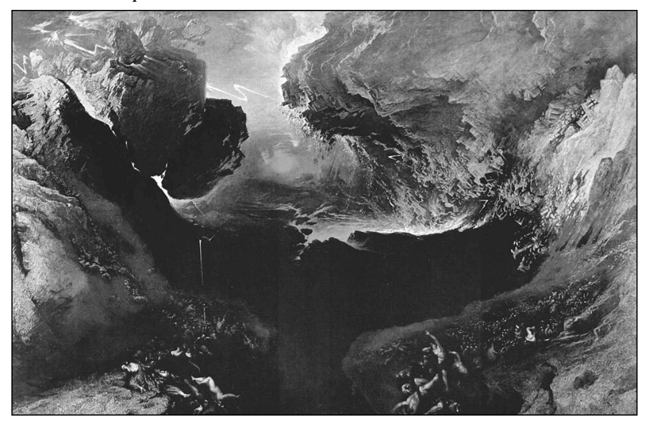
'The Great Day of His Wrath', by John Martin c 1853

At this point in the narration a significant word is first introduced which I will continue to explore. The 'invasion' comes in the form of the first appearance of Morwyn's father who 'invades' the harmonious trio of Morwyn, the narrator and Black Peter on a solitary shared walk¹¹. Morwyn has an affection for her father even though he is "a tremendous vivisector"—admittedly a perfunctory characterization! This dimension of the father's character creates a rift with his daughter and shocks the narrator as he recognizes "a gloating response to some kind of horrible cruelty": Black Peter himself reacts against the father's visualizing of "effective straps" used to restrain an animal victim .